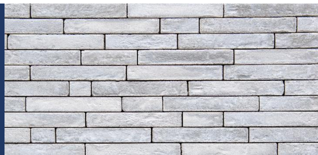
Photo 2 Lowie Design White Grey HV HF

“We believe that real ecological progress is only possible if it is also affordable”