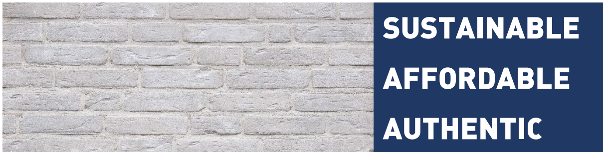
Photo 1 Lowie Rustique White WF HV

Although we are surrounded by millions of bricks every day, most of us don't think about bricks too often. For thousands of years, clay bricks have not changed and for a long time it seemed that they never would. However, everything changes and so do clay fired bricks. The fact is that the traditional energy-intensive furnacing process at high temperatures is simply not sustainable. Only a radical shift in the production method can preserve the classic brick we all appreciate.